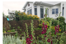
Madison Area Master Gardeners | Pg. 8