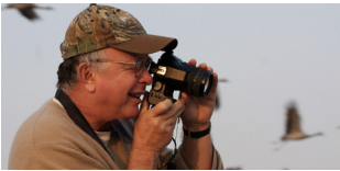
Saving Cranes and Wetlands | Pg. 4