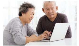
Assisted Living & Senior Home Contracts | p. 5