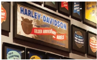
Milwaukee Day Trip | p. 2