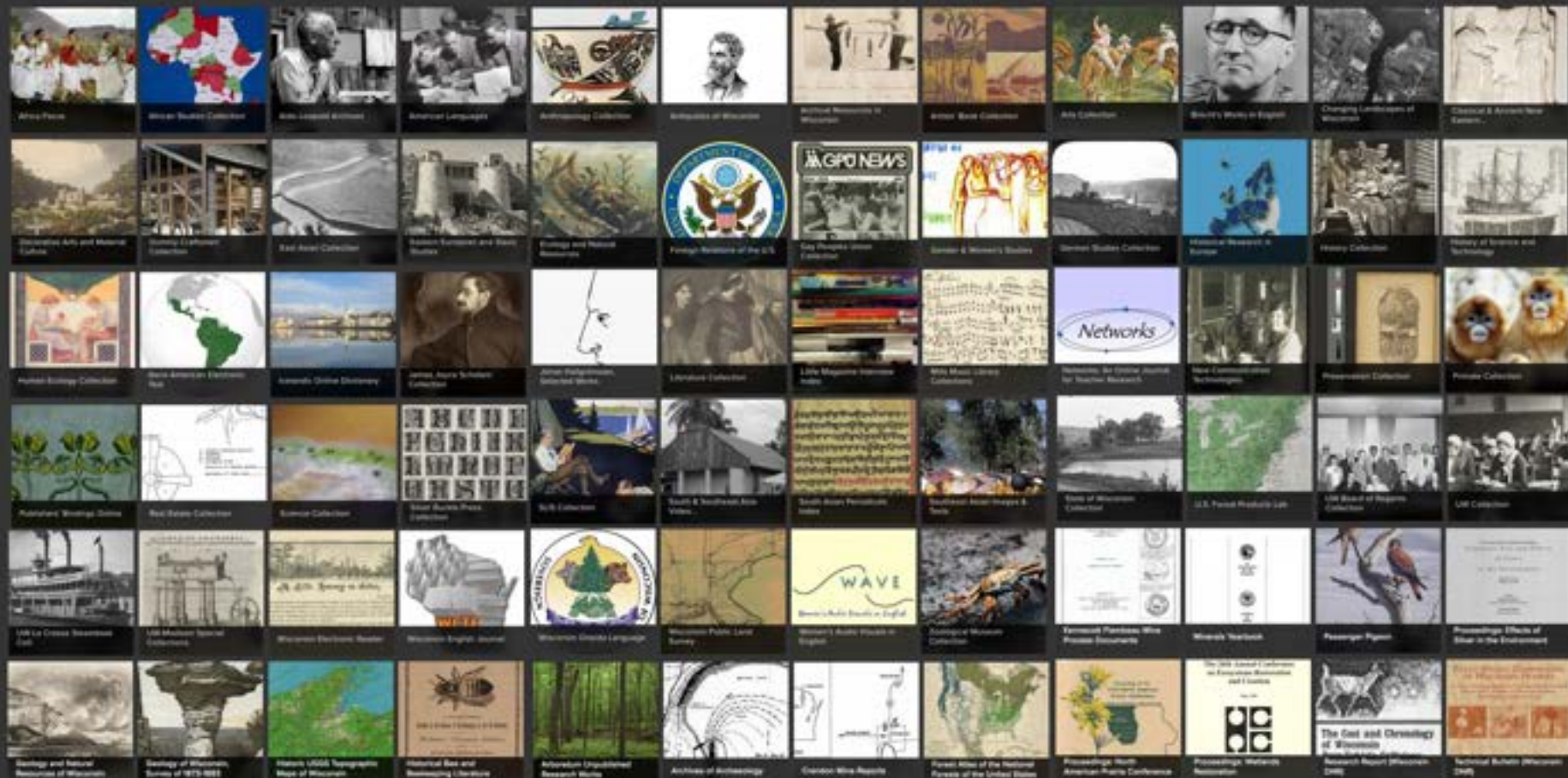
Wings of Peace British Student Collection Walt Whitman Archives Behavioral Linguistics Anthropology Collection Archives of Wisconsin Archival Resources in Wisconsin British Book Collection Arts Collection British Works in English Changing Landscapes of Wisconsin Classical & Ancient Near Eastern Decorative Arts and Material Culture Dennis Lehane Collection East Asian Collection Hudson's Bay and Great Lakes Farming and Natural Resources Foreign Relations of the U.S. Gay Peoples Press Collection Gender & Women's Studies German Studies Collection Historical Research in Europe History Collection History of Science and Technology Jewish Studies Collection Latin America in Electronic Text Landscape Online Dictionary James Joyce Scholar Collection John Galsworthy, John Galsworthy, Archival Works Literature Collection Litter Magazine Archive Mills Music Library Collection Networks: An Online Journal for Network Research New Communications Technologies Photography Collection Private Collection Publishing, Printing, Online Real Estate Collection Science Collection Short Stories Press Collection S&B Collection South & Southeast Asia Video South Asian Periodicals Index Southwest Asian Images & Texts State of Wisconsin Collection U.S. Patent Products List U.S. Board of Regents Collection U.S. Collection U.S. Census Historical Data U.S. Military Special Collections Wisconsin Electronic Reader Wisconsin English Journal Wisconsin Ethnic Language Wisconsin Public Law Society Women's Audio Project in English Zoological Museum Collection Farmstead Plantains Wine Process Document Wine's Yearbook Passenger Pigeon Proceedings Effects of Blue in the Environment Heritage and Natural Resources of Wisconsin Geology of Wisconsin: Summary of 1875-1881 Historic USGS Topographic Maps of Wisconsin Historical Bee and Beekeeping Literature Archaeology Unpublished Research Media Archives of Architecture Canadian Wine Reports Forest Sites of the National Parks of the United States Proceedings: North American Pacific Conference Proceedings: Northwest Association The God and Chronology of Wisconsin Research Report (Wisconsin, 2005) Technical Bulletin (Wisconsin, 2005)